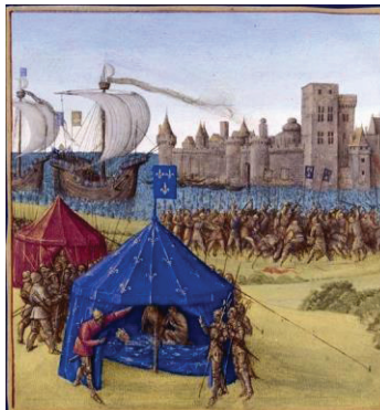
Death of King Louis IX

Louis's new Crusade embarked from southern France in July 1270. Soon after the French landed in North Africa, disease struck the troops and claimed the lives of both Louis and his son John Tristan.